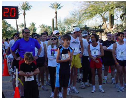
Scene from Inaugural 2006 ISES Run